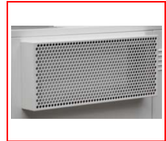
Warm air output grid with automatic non-return valve. Can be fitted on left or right side of the heater.