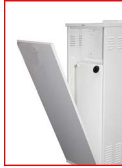
Back access door for oil integrated tank with gauge