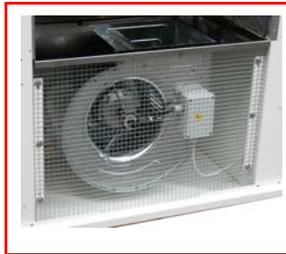
High pressure centrifugal fan silencers - IP55 Equipped with grid