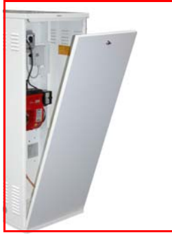
Front access door for burner, electrical equipment, room thermostat and oil filter