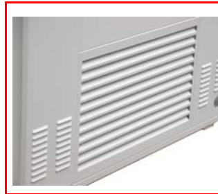
Air external inlet anti-rain grid. Can be fitted on left or right side of the heater.