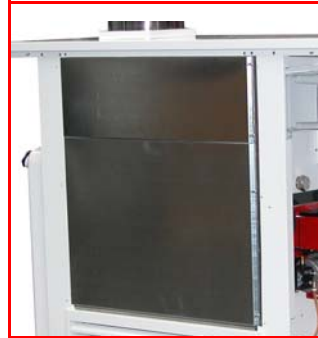
Double steel plate for thermo-acoustic insulation and to maintain the panels external cold, thus removing any risk of burns