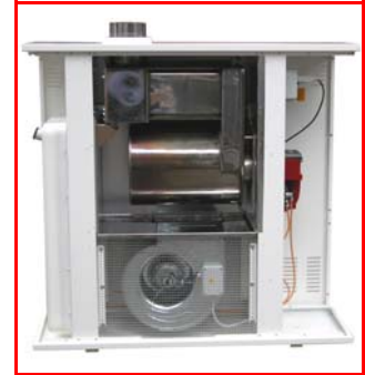
Quick accessibility with all the components for an easy maintenance (5 to 10 minutes to reach the fan and the combustion chamber)