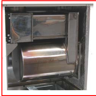
Stainless steel combustion chamber with high efficiency heat exchanger