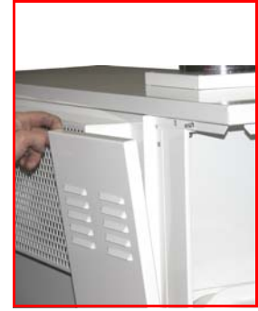
Fixing of the panels by inserts in order to facilitate the access and to avoid any external screws and bolts