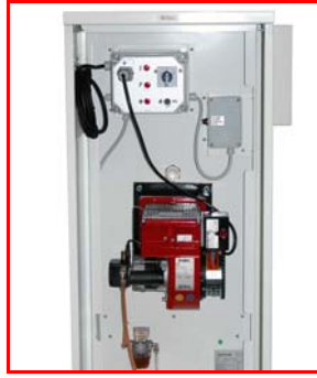
Combustion and electrical compartment